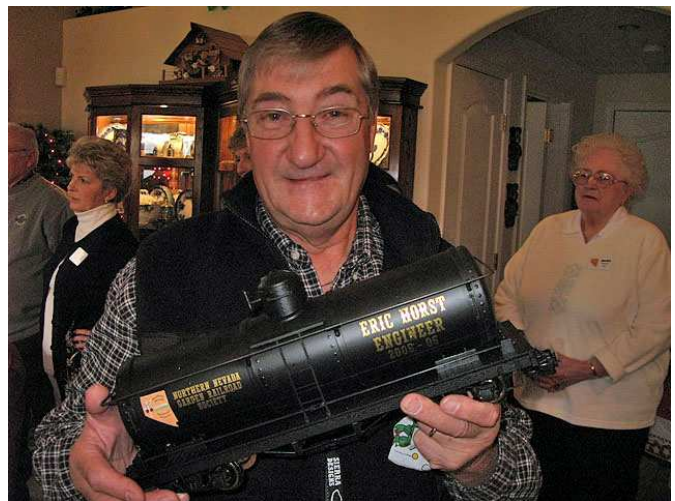
Look at what I got!